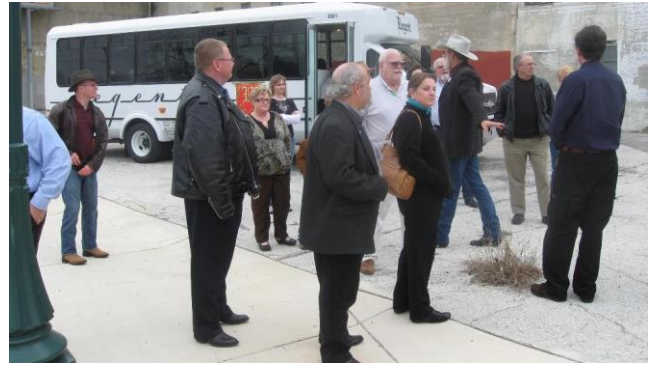
Closing out the reunion will be a Saturday evening dinner. Meet up at 6:00 p.m. at local owned Springhill Restaurant 2505 W Pecan St, Pflugerville, TX 78660

Bus tour in nearby Austin of Confederate sites Will stage, leave and return to the Hotel Departure time TBD Bus will be similar to the one the DCV had at the 2015 Reunion in San Antonio.