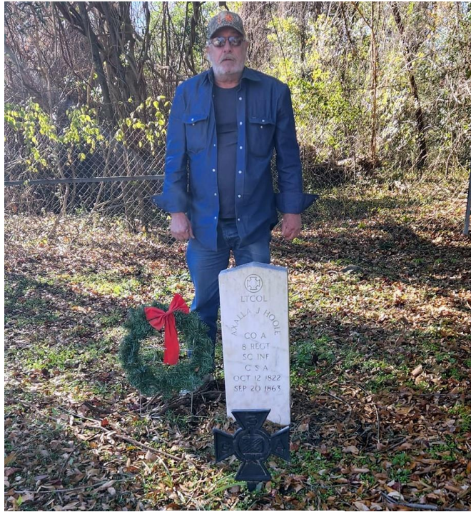
Lt Col Axalla J. Hoole Co A 8^{th} Regt SC Inft CSA