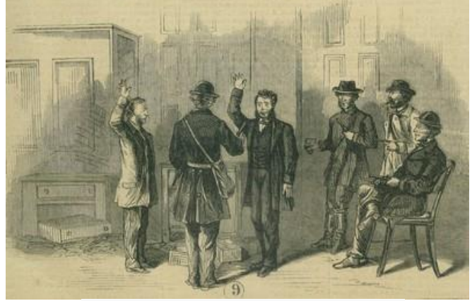
St. Albans bank tellers being forced to pledge allegiance to the Confederacy

The raiders killed one man and wounded two others in St. Albans. One Confederate was wounded.