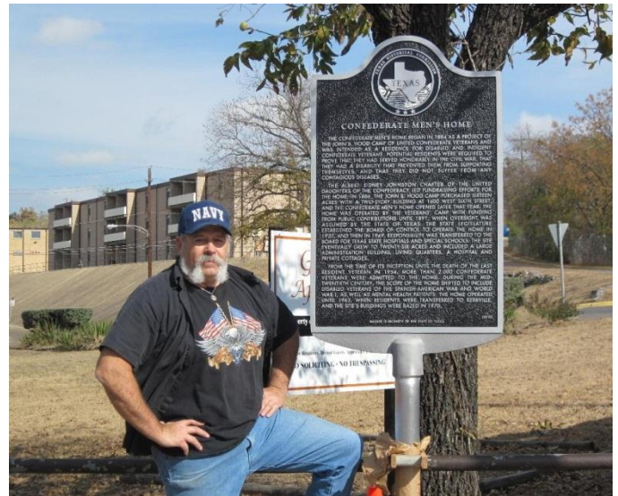
Ayers and marker to be dedicated