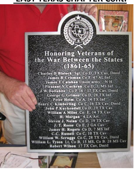
Gum Springs Cemetery Harrison County, Texas