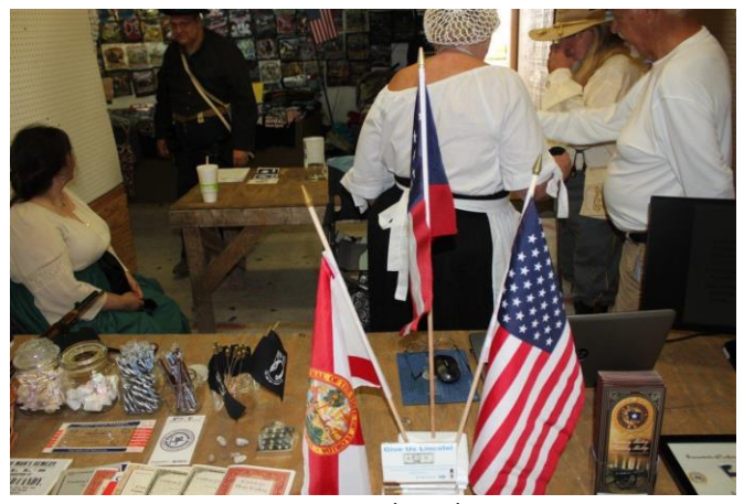
Get your DCV Brochure here

The group was well received and had many interested visitors. All were invited to attend the June 20<sup>th</sup> Chapter meeting. Donations even covered the cost of the booth. FINE JOB Y'All!