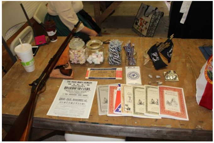
Literature "Southern Style", Firearms and Sweet Treats