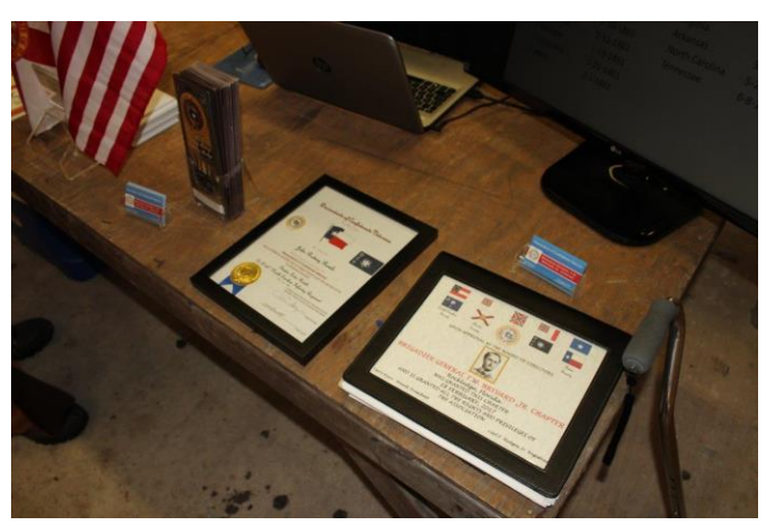
Promoting the DCV & the CSA