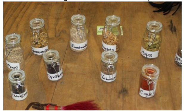
Check out the many herbs and spices