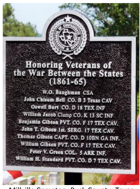
Millville Cemetery Rusk County, Texas