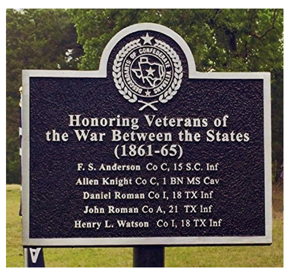
Pirtle Methodist Cemetery Rusk County, Texas