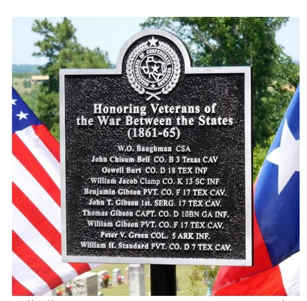
Millville Cemetery Commemorative Marker

The East Texas Chapter has added another permanent DCV Commemorative Marker at a cemetery in their area. The new marker is at the Millville Cemetery and it bears the names of ten Confederate Soldiers interred there. The cemetery is located 10 miles Northeast of Henderson, Texas.