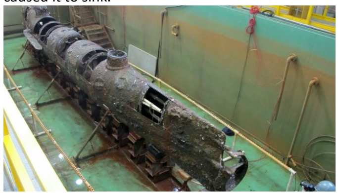
CSS H.L. Hunley in all its Southern glory

Born and built amid gray-cloaked secrecy the CSS H.L. Hunley was the first submarine to sink a ship, the USS Housatonic. The 40-foot vessel resembling a whale, had watertight hatches, two short conning towers, sea cocks, pumps and ballast tanks. The Hunley and its eight-man crew sank to the bottom of the sea on the moonlit evening of February 17, 1864, after it signaled to shore a success that changed naval warfare. Researchers are optimistic that as the conservation process continues modern day forensics will unlock the mystery of what caused it to sink.