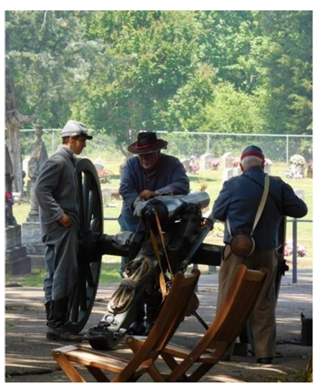
Special thanks to the Val Verde Battery for providing the artillery salute to the ten Confederate Soldiers interred In Millville Cemetery.