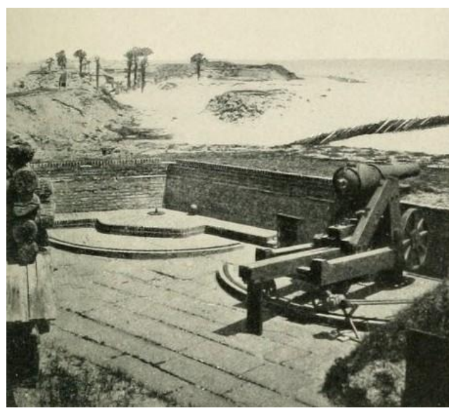
Fort Moultrie in the 1860's

The Stars and Bars fly proudly over Fort Moultrie. It is named for General William Moultrie, American Commander in the Battle of Sullivan's Island during the America Revolution. It was supplanted by Fort Sumter out in the bay as the principal defense of Charleston prior to the outbreak of the War Between the States. The site was turned over to the National Park Service in 1960, and is now part of Fort Sumter National Monument.