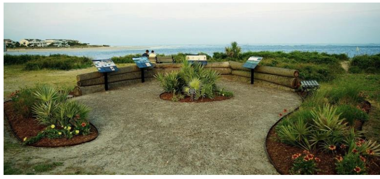
Fort Moultrie today. KEEP UP THE GOOD WORK SOUTH CAROLINA!