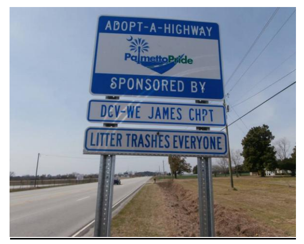
New members aren't the only thing the South Carolina Society is picking up these days! OUTSTANDING PROJECT!