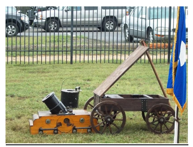
1838 Coehorn Mortar