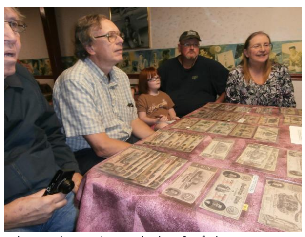
Members and get a close up look at Confederate currency.

Continued top of page Continued next page