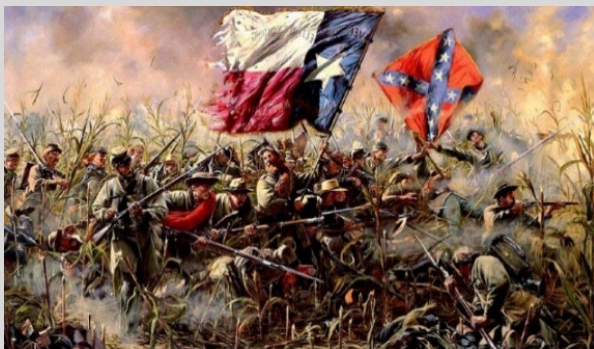
Battle of New Madrid and Island No. 10 - New Madrid and Island No. 10 Missouri

3 March to 8 April 1862 - Generals McCown and MacKall verses General John Pope. Casualties 4077 Confederate, 831 Union!