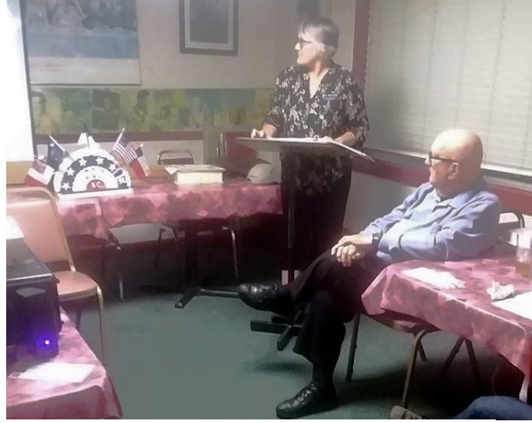
Her excellent power point presentation was on "Women of the Confederacy"