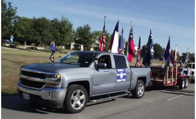
Beautiful Flags, Beautiful day

This year the Capitol Chapter contacted the City of San Marcos about participating in their annual Veterans Day Parade. San Marcos is approximately 30 miles south of Austin. They welcomed our participation and it appears we have found a new home for Descendants of Confederate Veterans