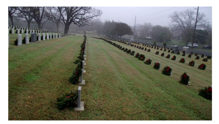
Rest in Peace Loyal Confederates