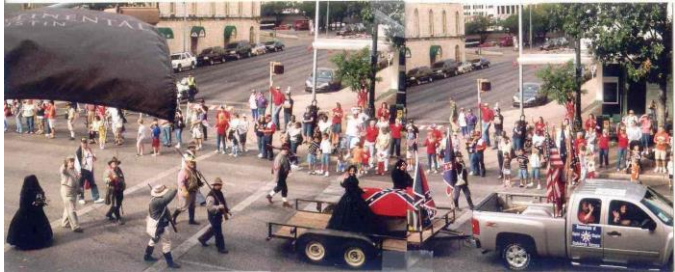
In the early days most marched. 13 years later, not so much.

The DCV was founded in 2005. In 2006 the Capitol Chapter participated in the Austin-Travis County annual Veterans Day Parade on Congress Avenue.