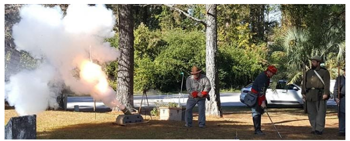
Coehorn Mortar in action