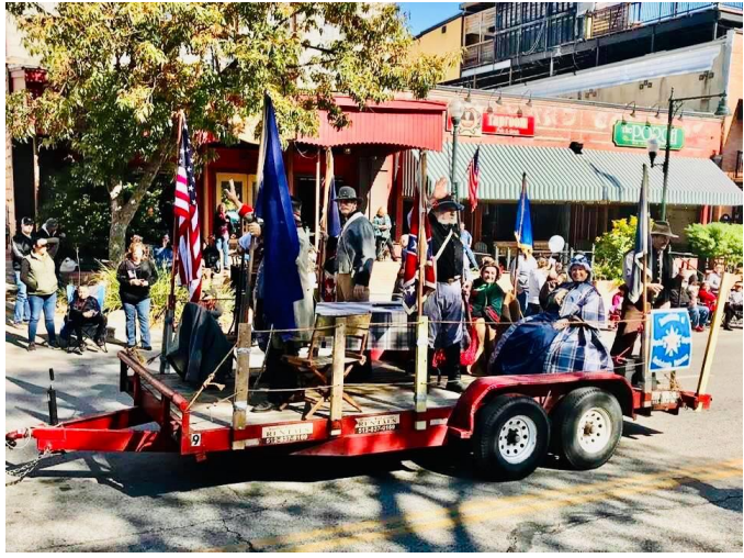
Downtown San Marcos, Texas