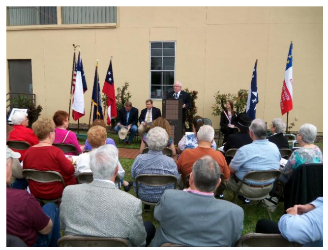
The dedication was attended by over seventy folks from all parts of Texas.