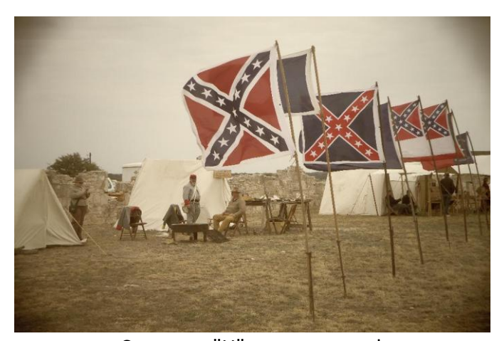
Company "H"s camp ground.