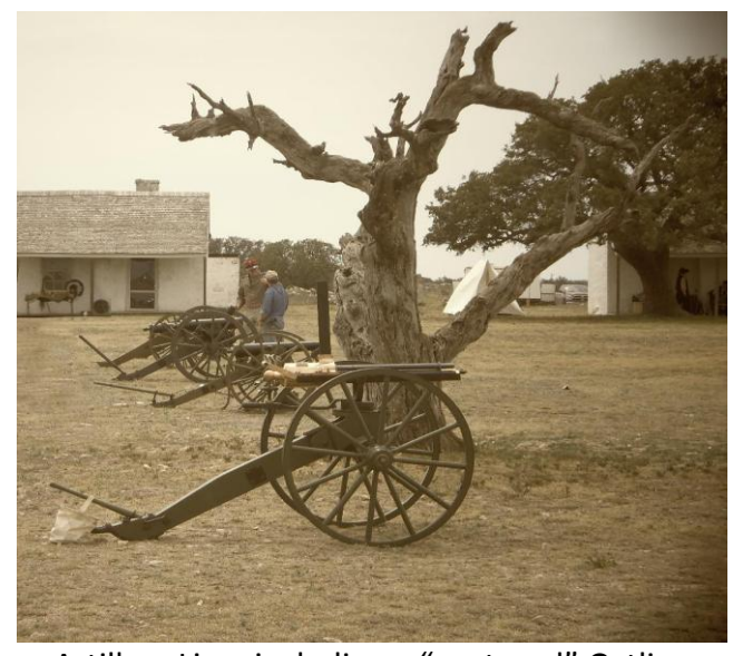
Artillery Line, including a "captured" Gatling